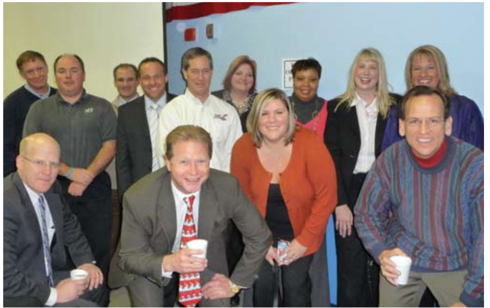
Alumni from the last several years return to assist with the "moving through the system"