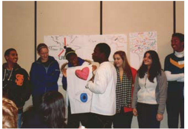
Learning Style 1 participants share their logo that depicts their style preference.