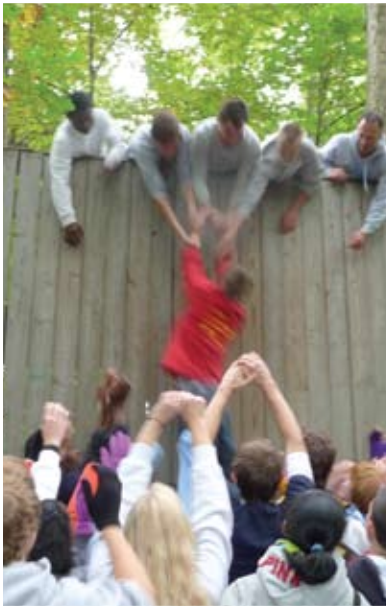
Youth Leadership participants work together to conquer "The Wall" at Camp Freundenswald.