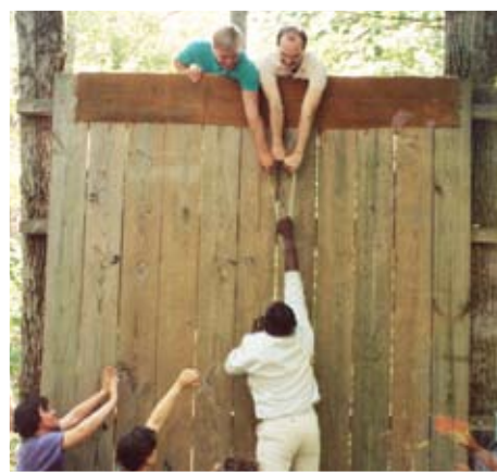
"The Wall" was a popular challenge for Leadership participants.