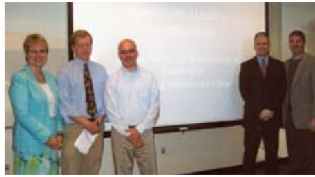
The Spirituality project team from Class 33 spearheaded the formation of the spirituality portion of the mind, body, spirit Leadership program day in January.