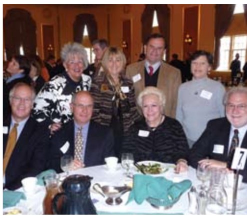
Graduates from the first few Leadership classes gather at the 35th anniversary luncheon.